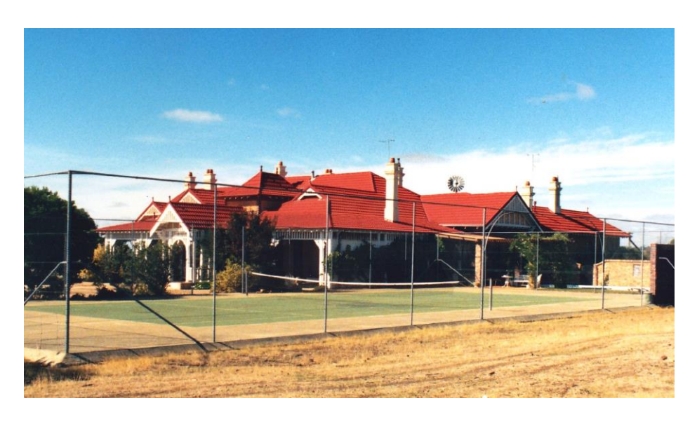
Hardie Family homestead Wallinar, Broomehill built in 1911.